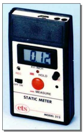
b. Model 212