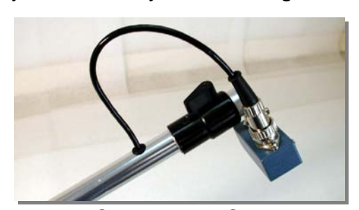
Figure 4.2-1: Surveyorstat Sensor assembly