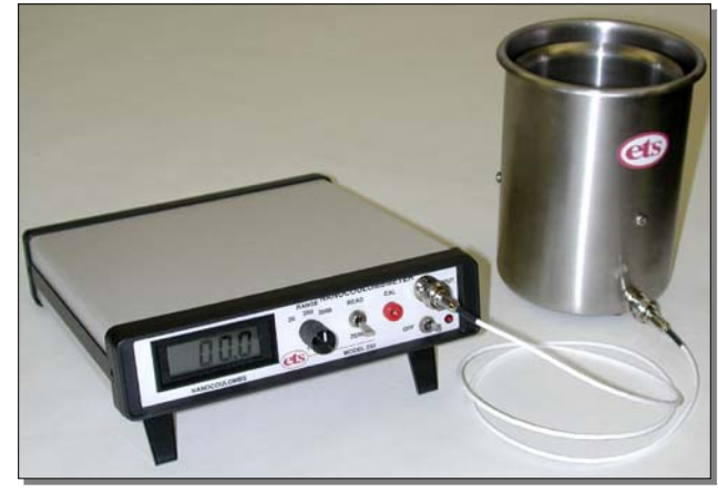
Figure 3.0-1: Faraday cup connections

Connect the Faraday cup or bucket to the BNC INPUT connector located on the front panel of the instrument as shown in Figure 3.0-1. If the remote READ/ZERO switch and or a recording device are being used, connect them to the respective output connectors located on the rear panel.