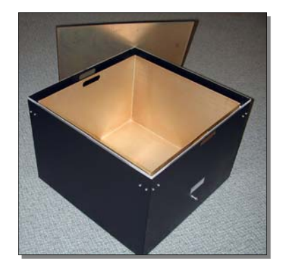
a. Model 231 b. Model 232 c. Model 233