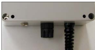
Figure 4.4-1: Ground plate connection