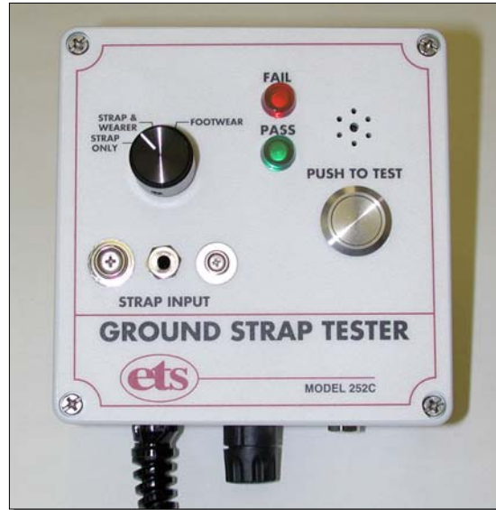
Figure 1.0-1: Model 252C Ground Strap Tester

The Model 252C Ground Strap Tester shown in Figure 1.0-1 is a precision wall or bench mounted test instrument that can test virtually all types of personnel grounding cable/wrist strap and heel strap assemblies. The instrument measures ESD grounding straps with a nominal resistance of 1 MegOhm. It can be used to test a strap assembly alone or a complete cable/wrist strap system while on the wrist of the user. The grounded power supply used in the Model 252C enables heel straps attached to personnel to be tested without any additional connections when used in conjunction with grounded floor systems (RTG <math>10^5</math> Ohms).