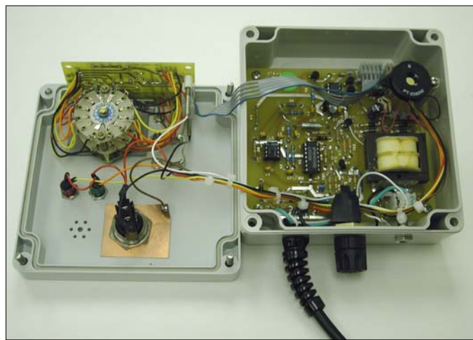
Figure 3.0-2: Interconnect cables