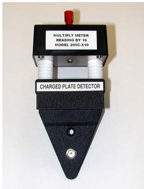
Figure 2.2-2: Model 205C-x10 Charged Plate Detector