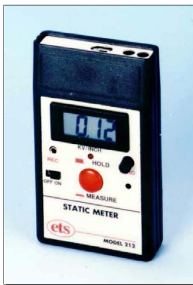
Figure 2.1-1: Model 212 Static Meter

The chopper stabilized sensor enables the Model 212 to accurately measure electrostatic fields in areas using air ionization. The Meter is powered by a 9V battery and features a conductive case as well as a convenient snap-on wrist strap cord to provide a hard ground connection. The Model 212 standard measurement range when used as a field meter is \pm 20\text{kV} at 1 inch (25mm) when measuring a large planar target in free space.