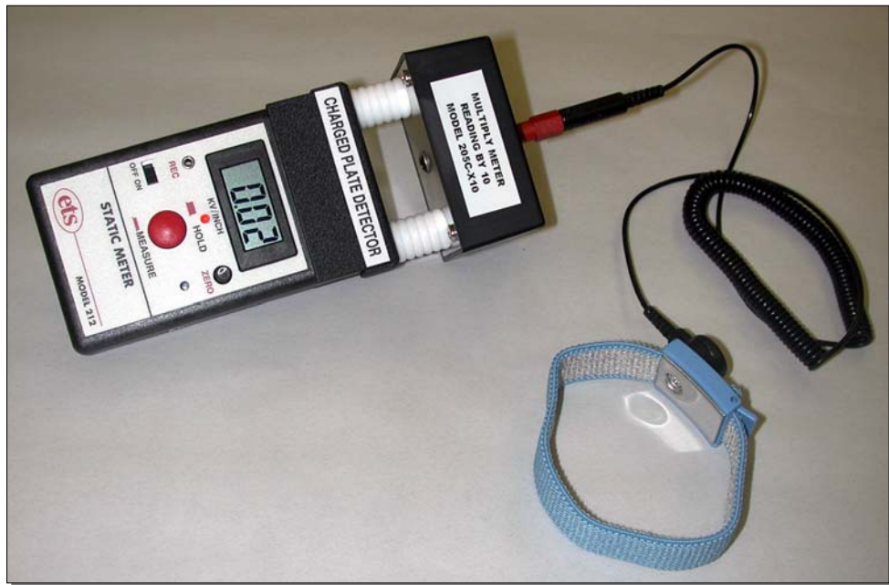
Figure 3.0-1: Charged Plate Monitor System Set Up

To perform a test first ground the detector plate momentarily, activate the Static Meter, then take a measurement. For those measurements requiring the handling of static dissipative materials, it is recommended that measurements be performed by two people: one person to operate the instrumentation and the other to handle the material. This is necessary to prevent any charge build-up on the material from being bled off through the grounded operator.