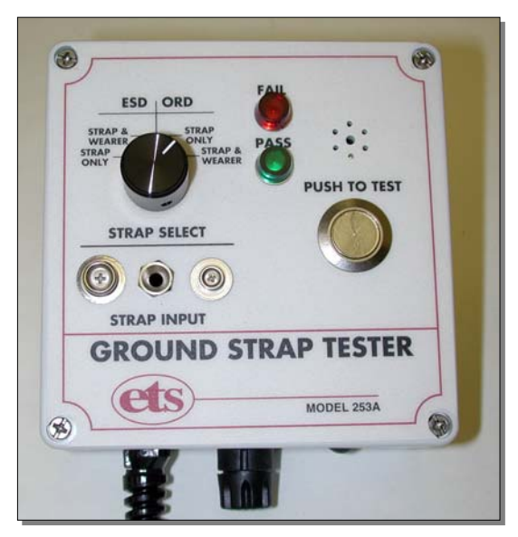
Figure 1.0-1: Model 253A Ground Strap Tester

The Model 253A Ground Strap Tester shown in Figure 1.0-1 is a precision wall or bench mounted test instrument that can test virtually all types of personnel grounding cable/wrist strap and heel strap assemblies. The instrument measures both ESD grounding straps with a nominal resistance of 1 Megohm and ORDNANCE grounding straps with a nominal resistance of 50 kOhms. It can be used to test a strap assembly alone or a complete cable/wrist strap system while on the wrist of the user. The grounded power supply used in the Model 253A enables heel straps attached to personnel to be tested without any additional connections when used in conjunction with grounded floor systems.