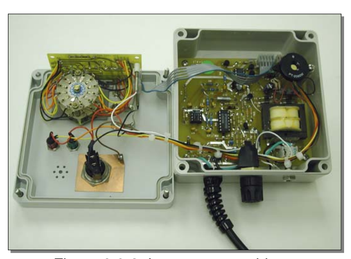
Figure 3.0-2: Interconnect cables